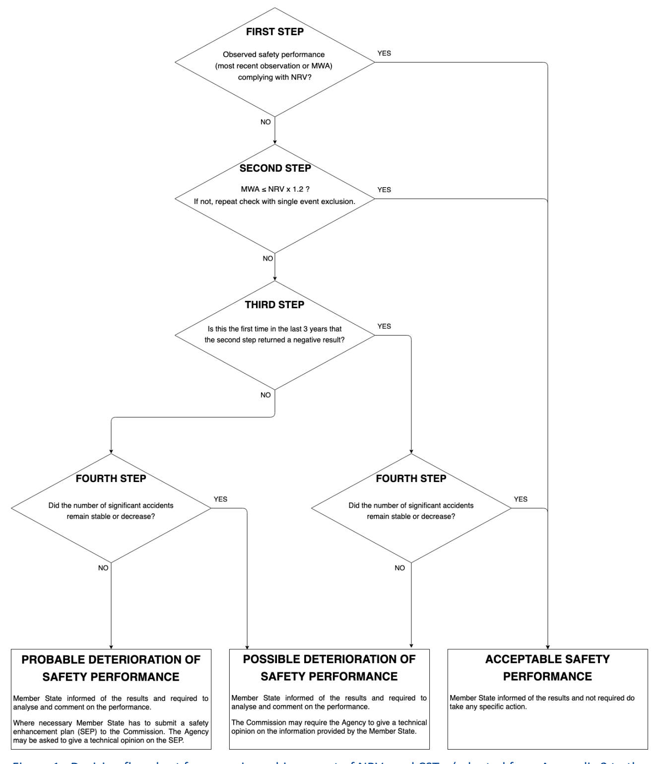
Figure 1 : Decision flowchart for assessing achievement of NRVs and CSTs. (adapted from Appendix 2 to the Method [3])