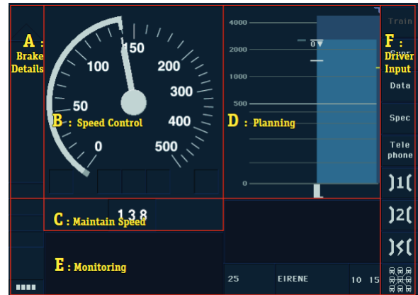
Fig. 3: Integrated Information in DMI (UIC, 1998, p. 5)

The concept of situational awareness has already been applied to both manual and automated operations in railways, for instance, for understanding signalling and control in rail operations (e.g., Golightly et al., 2010; Lo et al., 2016; Sharples et al., 2011), train driving (e.g., Brandenburger & Naumann, 2019; Rose et al., 2018) or rail maintenance and trackwork (e.g., Golightly et al., 2013; Tretten et al., 2021). In all these areas of railway, a significant number of automated systems and processes already exist from the perspective of human information processing. For instance, train control systems monitor speed and can (especially at a high level) continuously provide information from the infrastructure, such as monitoring ceiling and target speeds or braking target points. This information is integrated in an optimum manner in the Driver Machine Interface (DMI, see Fig. 3) taking human and organisational factors into account (Metzger & Vorderegger, 2012). It is a standardised interface for the European Train Control System (ETCS) between the driver and the train supporting the development of situational awareness.