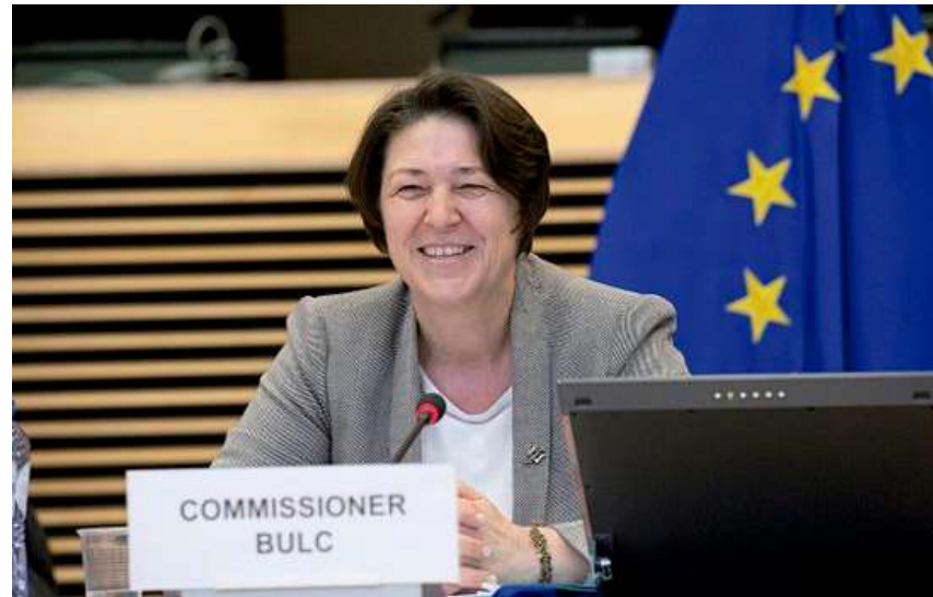
EU Transport Commissioner Violeta Bulc, April 2018

“Safety requires time and resources, but above all a commitment – from the top to the bottom. Let’s not leave anyone behind! As leaders, your behaviour counts more than anyone else’s. You have a major influence on culture and this is why we expect you to be safety leaders. ”