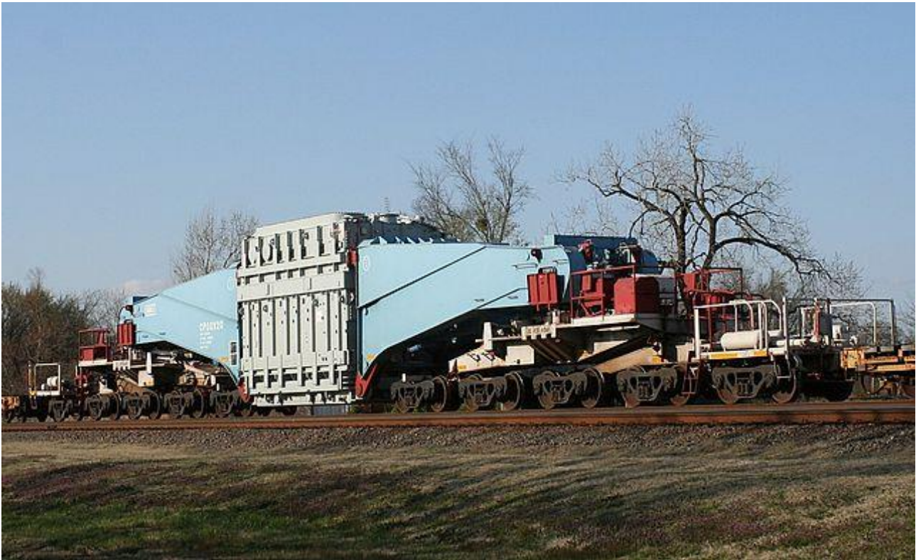
Figure 2: Two examples of vehicles that increase their length in loaded configuration and their payload is part of the vehicle structure (in unloaded configuration)