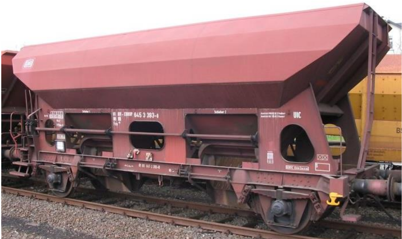
Figure 3: Example of a unit consisting of a (freight) wagon that can be operated separately, featuring an individual frame mounted on its own set of wheels

The following Figures 3, 4, 5, 6, 7 and 8 clarify these definitions.