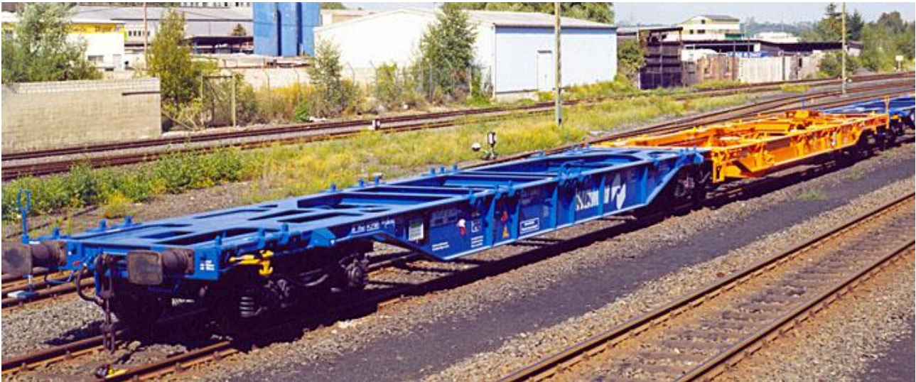
Figure 5: Example 2 of a unit consisting of a rake of permanently connected two elements; those elements cannot be operated separately