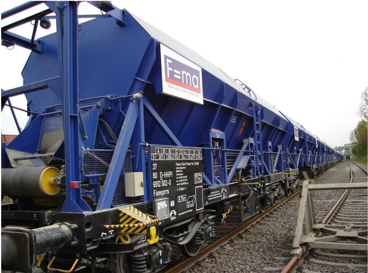
Figure 7: Example 1 of a unit consisting of separate rail bogies connected to compatible road vehicles