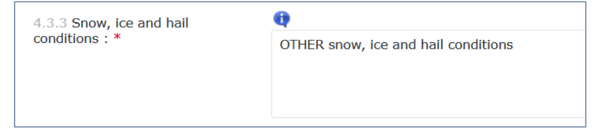
Figure 3 – Parameter 4.3.3 with "Other" value

For example, parameter [4.3.3. Snow, ice and hail conditions] previously allowed the users to introduce any "Other" value, as in Figure 3: