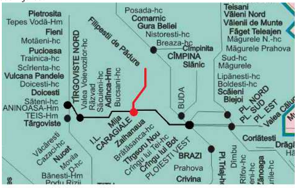
Position of the branch line carrying feeder traffic from the track section Ploiesti Vest - Targoviste

Following this accident, from these four persons from the car, two died and the other two were serious injured.